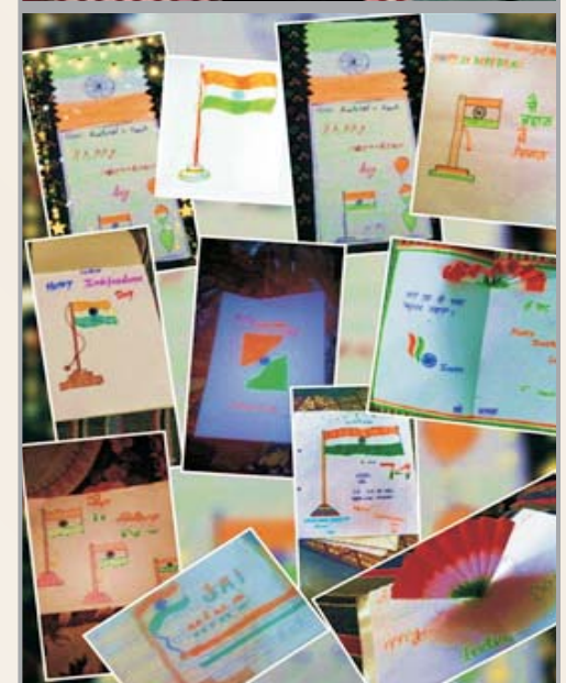
Creativity of NDS students

ensure that the local flavour of the region is kept intact so that the child feels at home in the new environment.